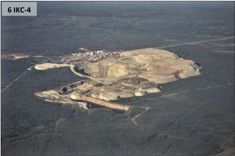
A principal fieldtrip was a visit to some of the kimberlites of Yakutia. Mines included Aikhal, Zarnitsa, Udachnaya, Sytykan, Yubileinaya and Mir. Delegates initially flew to Polyarny and this journey overflew the Internationalny mine, Figure 6 IKC-4 , with its distinctive pipe landslip.