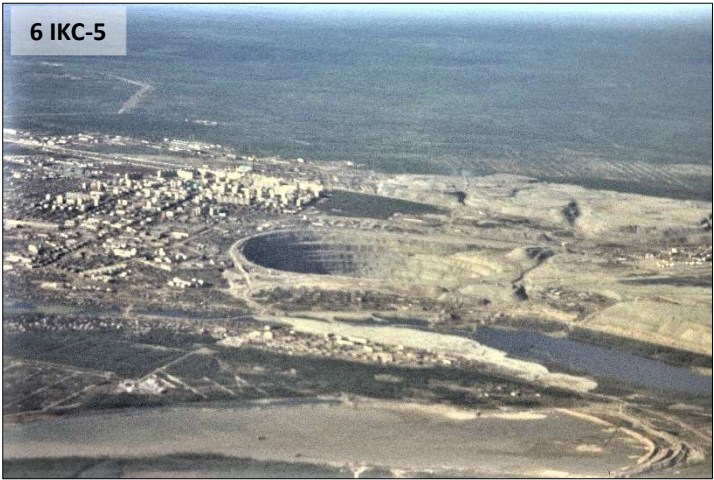
Figure 6 IKC-5 is the Mir kimberlite with the city of Mirny beyond and Figure 6 IKC-6 a view of the pit from the rim of the mine.