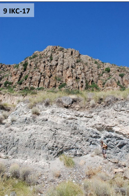
A second centre was that at Cancarix, shown in Figure 9 IKC- 17 , but the height of this lamproite was mitigated by a visit to a winery at Jumilla, Figure 9 IKC- 18 .