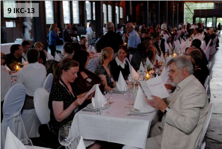
Figure 9 IKC- 13 is a general image of delegates preparing for a feast.

The Conference dinner was held in a converted railway shed, known as the Bockenheimer Depot, Figure 9 IKC- 12 showing the guests assembling. This event was extremely well organised as the pictures compiled by Heidi will show.